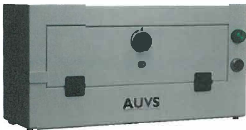
The UV Box - Quickly becoming the healthcare standard in non-chemical disinfection of mobile handheld devices.